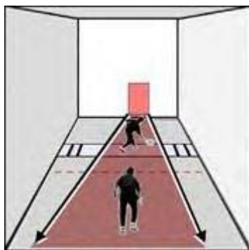
Screen Serve (Fig 2)

Serve from center area away from serve. Could be a screen serve if ball path was closer to the server and further from the side back wall corner. Figure 2 shows the same player positions with the serve passing too close to the server.